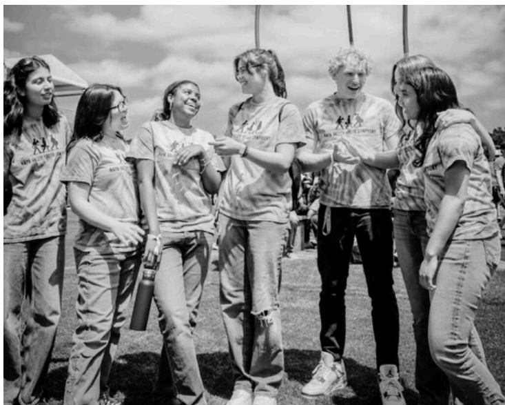
NVYS AT BOTTLEROCK NAPA VALLEY

YOUNG MUSICIANS AGES 8-18 ARE INVITED TO LEARN MORE ABOUT OUR PROGRAMS, ENSEMBLES AND AUDITION PROCESS!