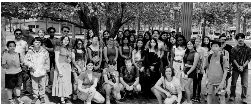
NVYS AT 9/11 MEMORIAL IN NEW YORK CITY

taught me the joy of creating music, and showed me how to put emotion into every movement. Since then, I've realized the full value of that thought: music is art, and art is meant to make you feel something. Like the Ancient Greeks and their tragedies, music can be incredibly cathartic—which is probably why music is universally loved. Through my 6+ years in NVYS, I've continued to learn about the joy of music: particularly, playing in a group. I especially remember our trip to New York last summer, and our heavenly concert at Carnegie Hall. I can't even begin to describe the acoustics in that room—you truly had to be there. It was a very special experience, being able to play music on that stage. I'll never forget the moment—mid concert—that I paused to really pay attention to the sound reverberating in the hall. Going into the future, I expect my journey through music to change once again. I'll never stop playing the violin, but I don't see myself playing professionally either. I'm looking forward to taking more of an independent/hobbyist route: playing more Irish jigs, solo pieces, and perhaps joining a small quartet with friends. I have enjoyed playing in a big symphony, but I find that the small groups are my forte. As the beginning comes to an end, I find myself reflecting fondly on my time with music in Napa. I'm looking forward to whatever the future holds. Next year, you might find me studying a physics textbook, or playing an Irish jig in a pub—we'll see.